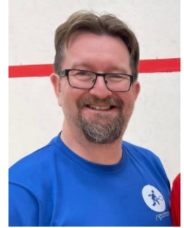
Committee member and squash coach