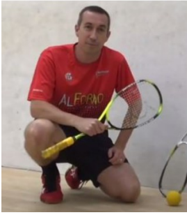
Treasurer and squash coach