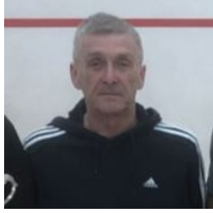
Chairman, secretary and County Committee representative