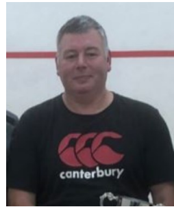
Committee member and squash coach