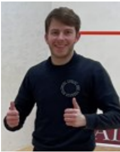
Committee member, 1st team club captain and squash coach