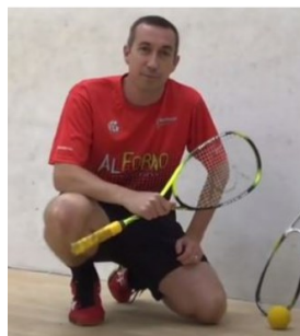
Treasurer and squash coach