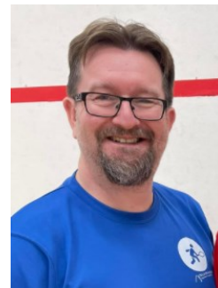
Committee member and squash coach