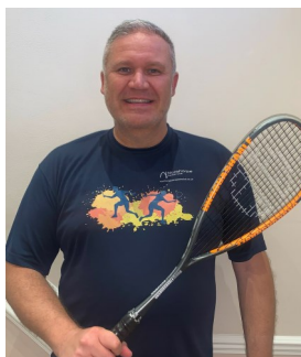
Committee member and squash coach