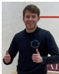
Committee member, 1st team club captain and squash coach