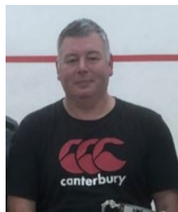
Committee member and squash coach